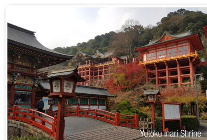
Yutoku Inari Shrine

DAY 3 : NAGASAKI / SAGA / FUKUOKA (Breakfast / Lunch / Dinner)