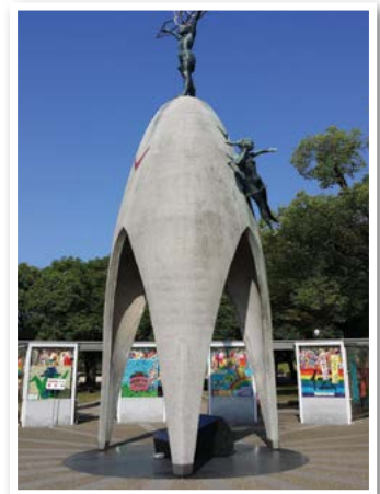
Children's Peace Monument (Hiroshima)

After a good breakfast, we transfer to Osaka Itami Airport for our flight back to Singapore (via Narita / Haneda Airport) sweet memories of ANA First Choice Holiday.