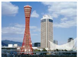
Kobe Port Tower