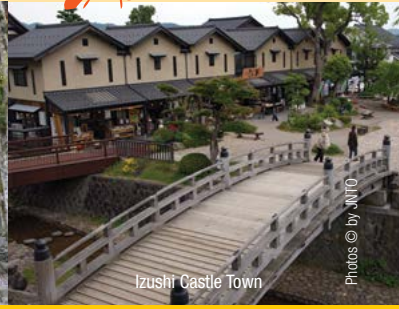
Izushi Castle Town